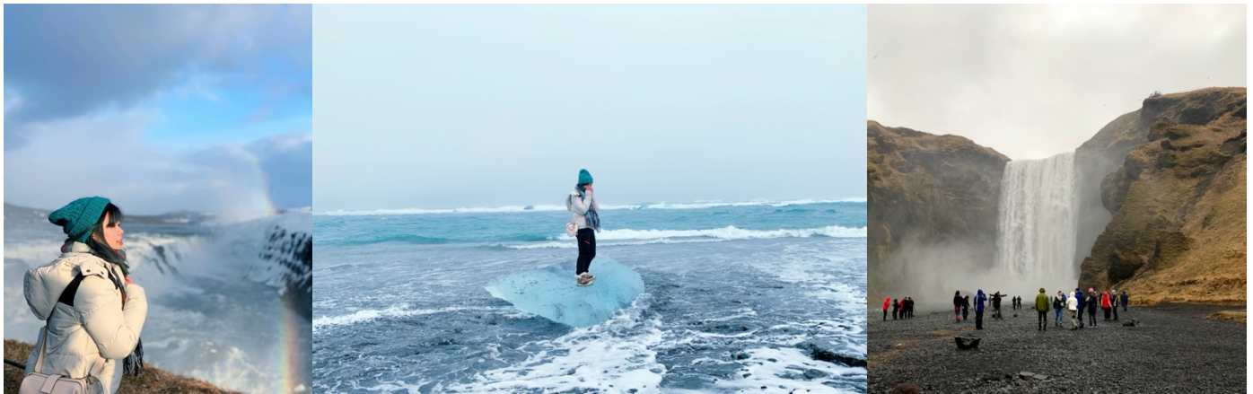
Photos taken in Iceland

In February, I found myself traveling in countries within northern Europe most of the time, as the course schedule was not tight and I have a lot of free time. Iceland is definitely a must-visit place if you like the nature, even if you don't, you will find yourself gasping for the magnificent formation of waterfalls and the breathtaking scenery once you see them. My friend and I joined a 3 day tour, including the Golden Circle, Blue Lagoon and the South Coast. One of the most exciting parts would definitely be the ice-caving, which allow us to walk on the ice and have a glimpse of what's inside the crystal blue cave.