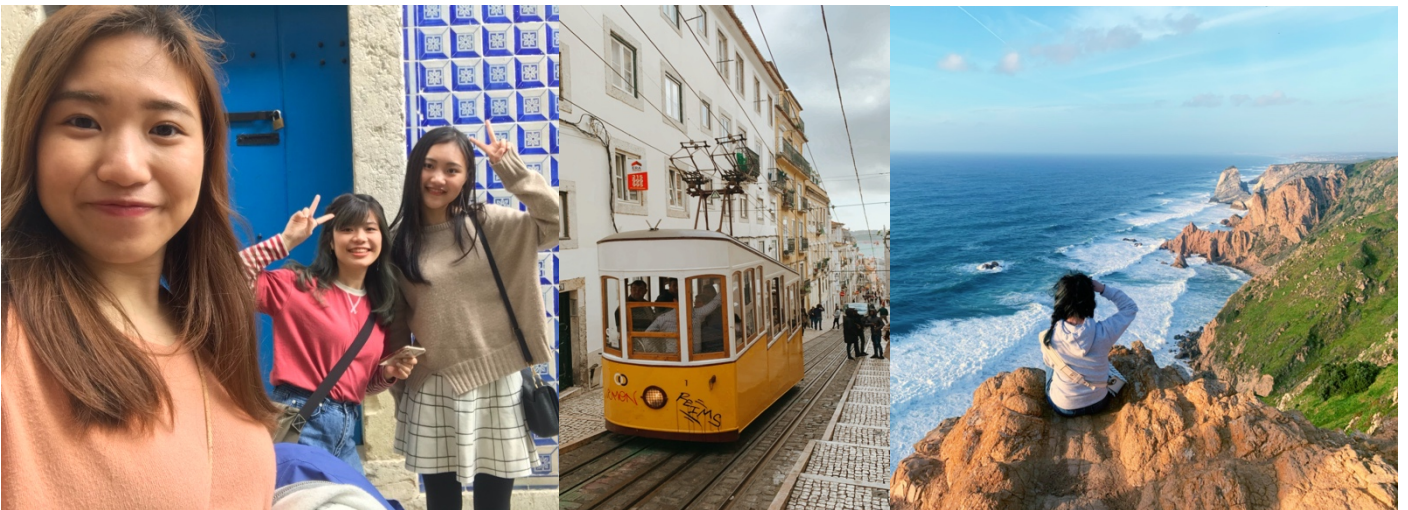
Photos taken in Lisbon, Portugal

As one of my course announced a sudden schedule change, I got a week-off so I traveled to Spain and Portugal with my friends. Originally, I planned to visit Spain again in the next month therefore I only went to Barcelona and save some spots for the next trip, however, thanks to corona, all of my trip plans have to be suspended ☹️. Nevertheless, I am grateful that I decided to pay a visit Barcelona at the first place. Though I only spent around 2 days there, I visited a lot of famous tourist spots such as Casa Mila, Casa Batlo, Park Güell and the Sagrada Família. I have always wanted to visit the Sagrada Família and it is definitely worth visiting. If you plan to visit there, please remember to buy the ticket online in at least 2 weeks in advance, because you can only visit there within your reserved timeslot and no walk-in is allowed.