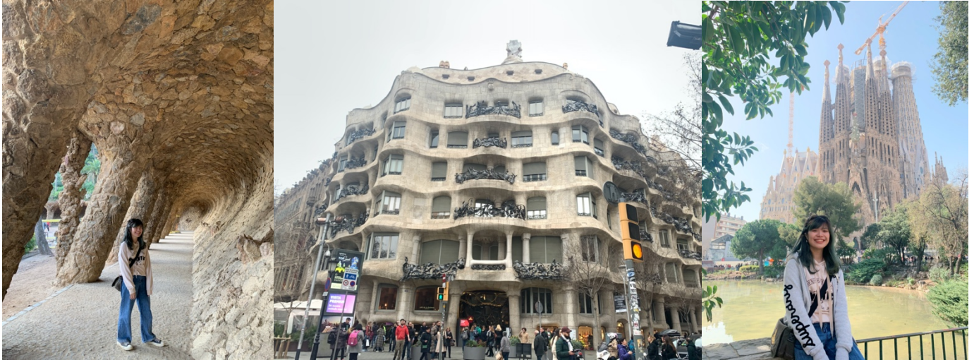
Photos taken in Barcelona, Spain

As one of my course announced a sudden schedule change, I got a week-off so I traveled to Spain and Portugal with my friends. Originally, I planned to visit Spain again in the next month therefore I only went to Barcelona and save some spots for the next trip, however, thanks to corona, all of my trip plans have to be suspended ☹️. Nevertheless, I am grateful that I decided to pay a visit Barcelona at the first place. Though I only spent around 2 days there, I visited a lot of famous tourist spots such as Casa Mila, Casa Batlo, Park Güell and the Sagrada Família. I have always wanted to visit the Sagrada Família and it is definitely worth visiting. If you plan to visit there, please remember to buy the ticket online in at least 2 weeks in advance, because you can only visit there within your reserved timeslot and no walk-in is allowed.